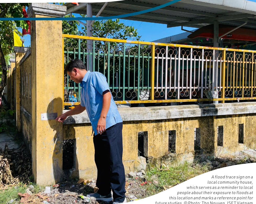
A flood trace sign on a local community house, which serves as a reminder to local people about their exposure to floods at this location and marks a reference point for future studies.